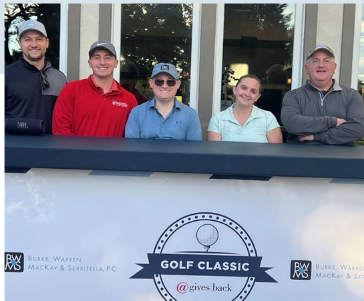
@properties 4th Annual @Gives Back Golf Classic fundraiser benefitting several worthy Chicagoland charities.