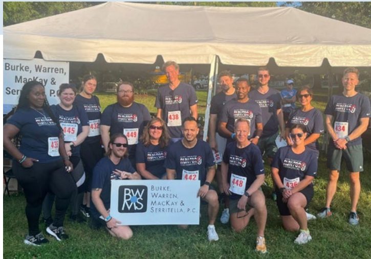
Burke, Warren, MacKay & Serritella laced up our running shoes for Race Judicata 2024 . All proceeds fund ChicagoVolunteer Legal Services, the first and preeminent legal aid provider in Chicago. Equal access to legal assistance is a fundamental right, and supporting this right is a responsibility we all share.