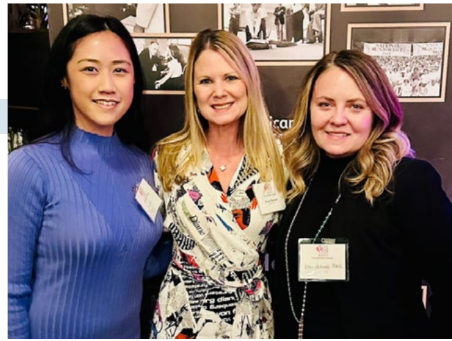
Chicago Counsel for a Cause annual fundraiser on behalf of the American Heart Association to support their mission dedicated to ensuring equal access to quality healthcare.