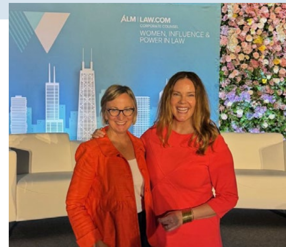
Women, Influence & Power in Law (WIPL)