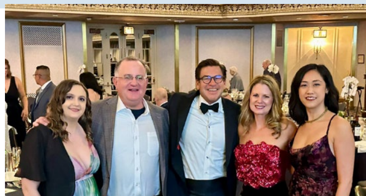
Haymarket Center's 2024 Gala 3rd annual event aims to shine a light on recovery and recognizes the organization's partners who contribute to patients' success – this organization is the largest and most comprehensive provider of treatment for substance use and mental health disorders in Chicago.