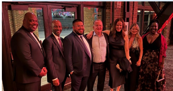
Project H.O.O.D. 10th Annual Fundraising Gala celebrating another year of successful fundraising milestones in support of their ongoing mission to help transform lives and communities throughout Chicago.