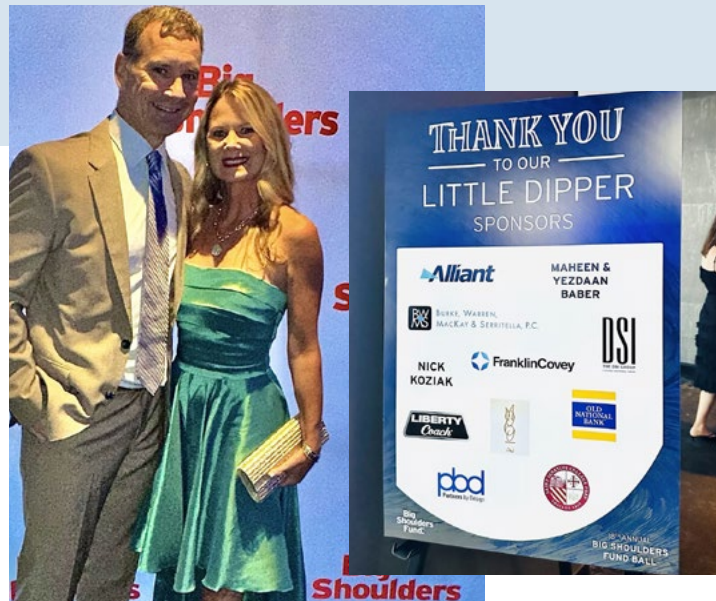
18th Annual Big Shoulders Fund Ball 2024 supporting scholarships that provide financial aid to some of the most deserving students throughout Chicagoland.