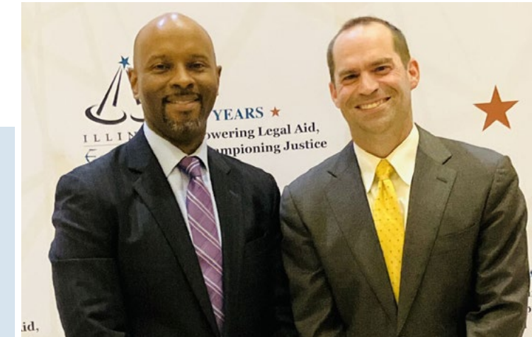
Proud to support the Illinois Equal Justice Foundation for all of their amazing work ensuring equal access to justice across our great State of Illinois, and congratulations on its 25th Anniversary.