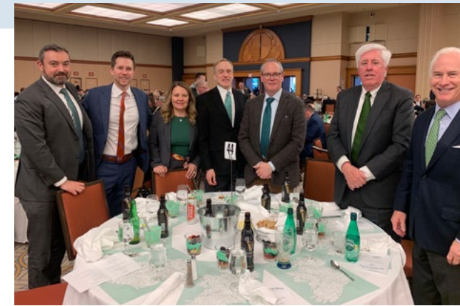
Celtic Legal Society of Chicago's 2024 St. Patrick's Day Luncheon