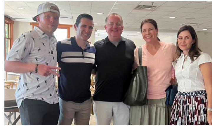
Buckets Over Bullying golf fundraiser supporting their mission to stop cyberbullying of children and teens through education, lawmaking and legal action.