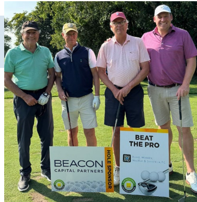
The Savills Landlord Challenge raises funds to support worthy Chicago area causes. Proceeds from the outing will benefit Compass Chicago, which partners with volunteers to provide pro bono consulting services to non profits, and San Miguel School, a private school serving students in Chicago's Back of the Yards neighborhood.