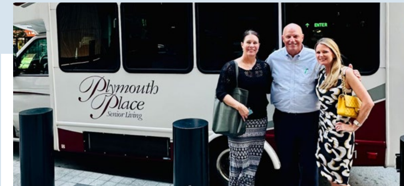
Plymouth Place Senior Living Skydeck Soiree where attendees connected to share developments in the organization's nonprofit community and reaffirm their mission of enhancing the lives of their residents, investing in their employees, and giving back to the local community.