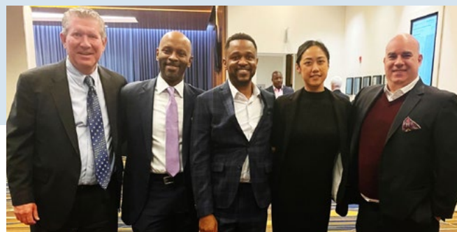
Proud Members of the Better Business Bureau