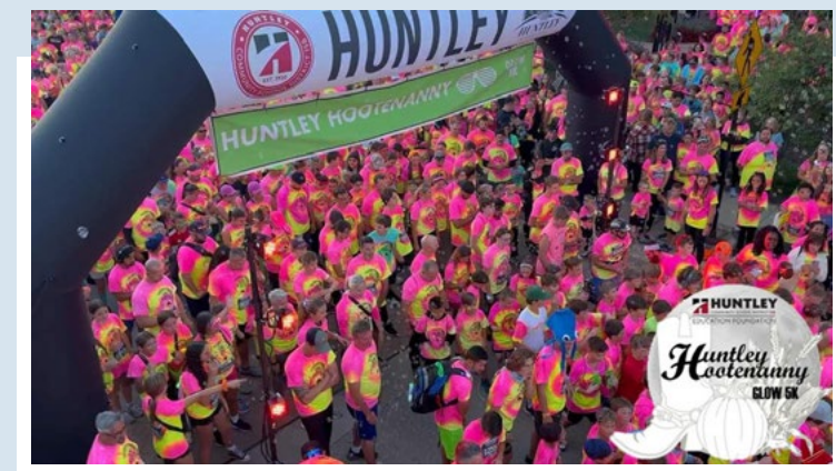
Annual Huntley Hootenanny Glow 5K run/walk on September 7, 2024 benefiting post-high school student scholarships and ongoing classroom initiatives on behalf of the Huntley 158 Education Foundation.