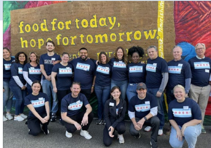
Burke Warren's annual day of service at Nourishing Hope , one of Chicago's largest and longest-operating hunger relief organizations. Our team gathered together to pack meal kits and household supplies for local residents in need.

Burke Warren continued its tradition of giving back to the communities we serve through strategic sponsorships and charitable efforts. Our commitment to making a positive impact was reflected in our support of various organizations, initiatives, and events that align with our core values.