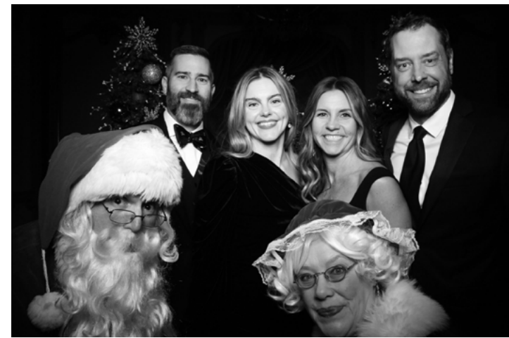
2024 Spirit of St. Nicholas Ball raised $3 million in aid for 2024 to benefit the recipients of Catholic Charities' work within our communities.