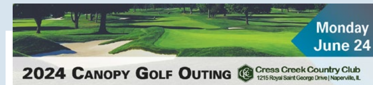
Giant Steps 3rd annual golf outing supporting the Canopy program, which provides education, vocation, and purpose for young adults with autism. The Canopy Adult Program , a division of Giant Steps, is designed to allow adults from across the autism spectrum to participate in a meaningful, safe, and supportive environment.