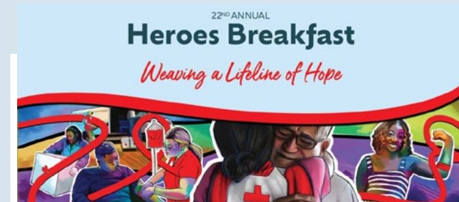
American Red Cross of Greater Chicago 2024 Heroes Breakfast