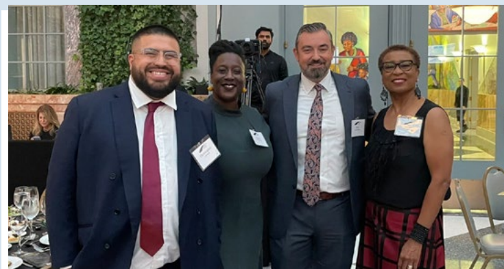
Good Trouble Gala hosted by the Chicago Lawyers' Committee for Civil Rights supporting their ongoing mission to secure racial equity and economic opportunity for all.