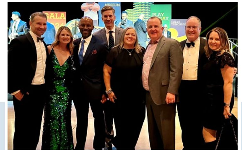
Chicago Children's Museum 2024 Gala , the museum's annual fundraiser and support their mission to create extraordinary learning experiences – both in the museum and within our communities – for years to come.