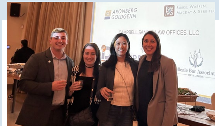
15th Annual Vino + Van Gogh supporting Chicago Volunteer Legal Service in their mission to provide comprehensive, efficient, and cost-effective legal aid to those in need throughout Chicago.